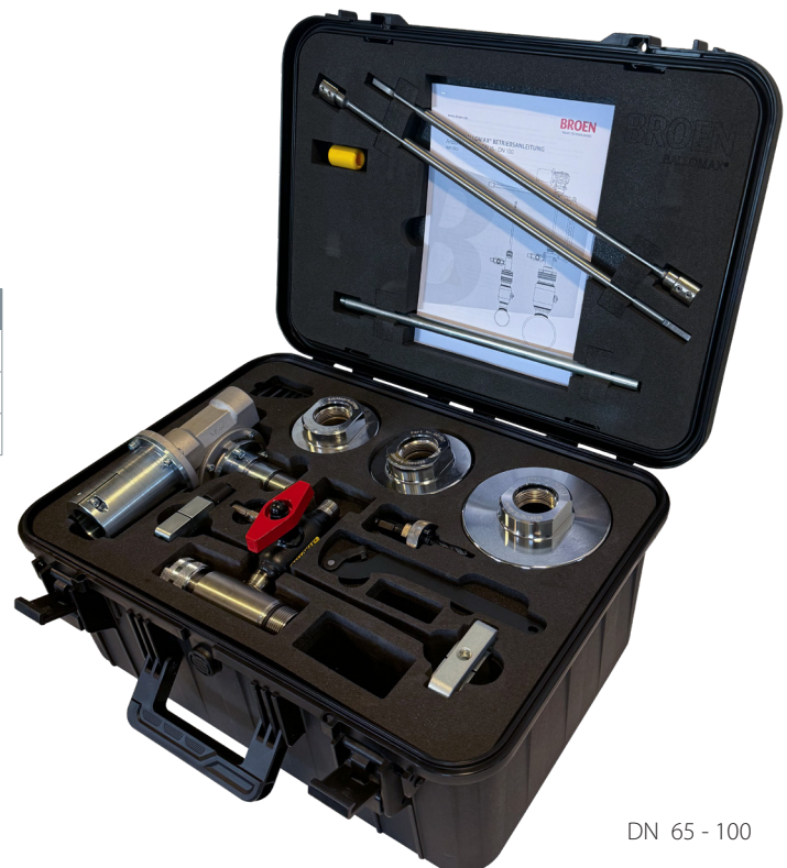
DN 65 - 100

For the new optimized BALLOMAX® hot tapping valves DN 65 to DN 100 full bore there will be an updated toolset / expansion set. With this toolset / expansion set the BALLOMAX® hot tapping valves in the range DN 65 to DN 100 reduced and full bore can be used.