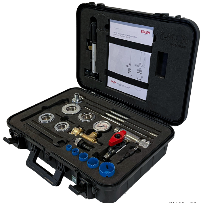
DN 15 - 50

The basis case 68 501 015 000 and the extension case 68 503 065 000 can be used with the previous delivered and also the new optimized BALLOMAX® hot tapping valves with reduced bore.